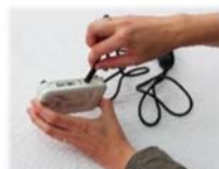
11. Insert the round plug of the power supply in the socket at the rear of the receiver