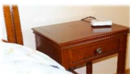
10. Put the receiver on the bedside table (out of children's reach)