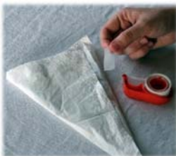
8. If necessary affix the paper to avoid a direct contact of the urine-detector with the skin