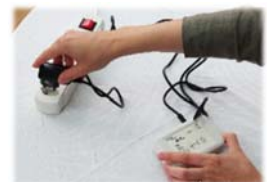
12. Plug the power supply into an electrical outlet 230V → standby is confirmed by a blue light + acoustic signal