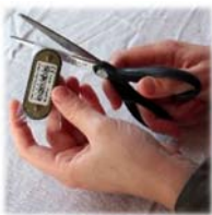
3. Unpack the transmitter