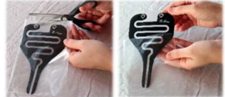
2. Unpack the urine-detector