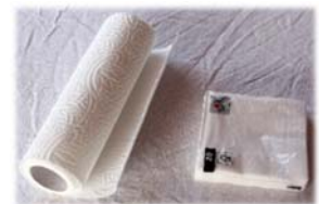
5. Prepare the paper or towel