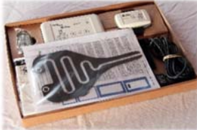
1. Preparation of the elements of the Pipi-Stop