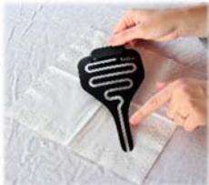
6. Place the urine-detector on the paper in the middle diagonally (transmitter above / Pipi-Stop must be legible)