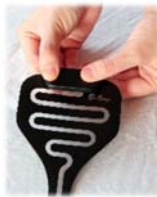
4. Fix the transmitter on the urine-detector. The polarity does not matter